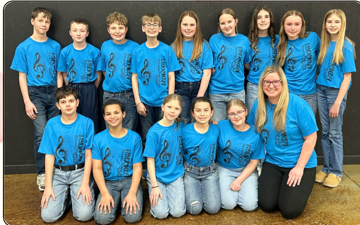
Elementary Vocal Festival