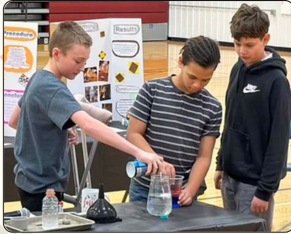
6 th grade Science Fair