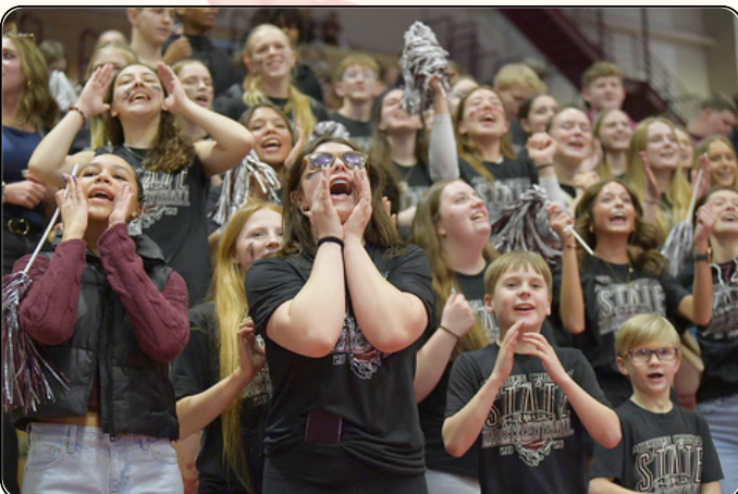
6 th Place finish at State B's