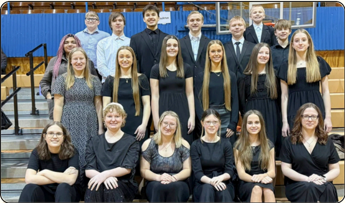
9-12 Region Music Contest