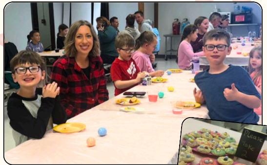
Our first Friends & Family Easter treats!