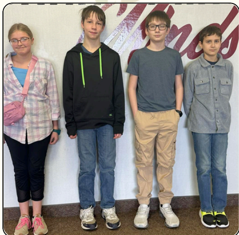
Mathcounts attended NE Chapter Competition